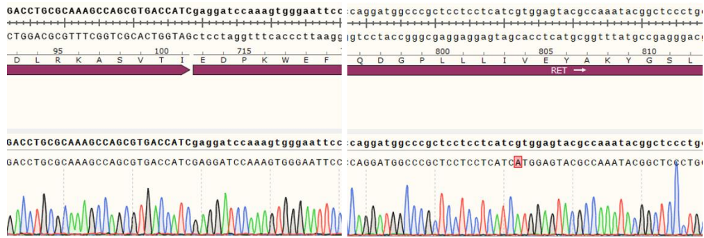
Figure 2 | The CCDC6-RET mutation analysis by Sanger sequencing.